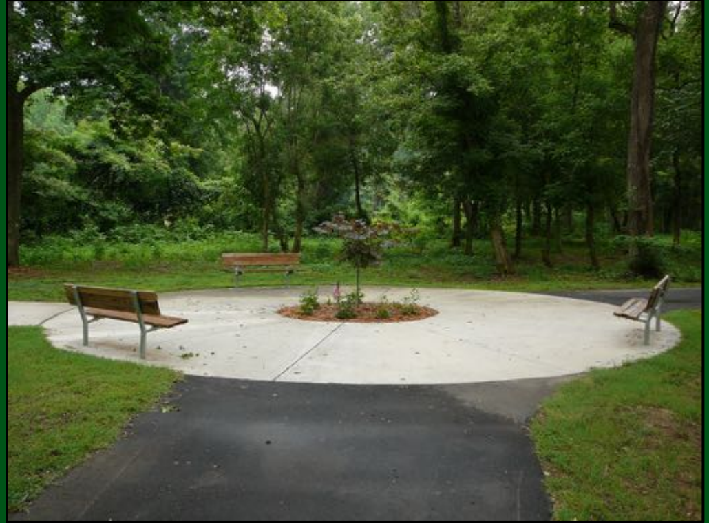
Arnold Drive to Masonic Road Reach