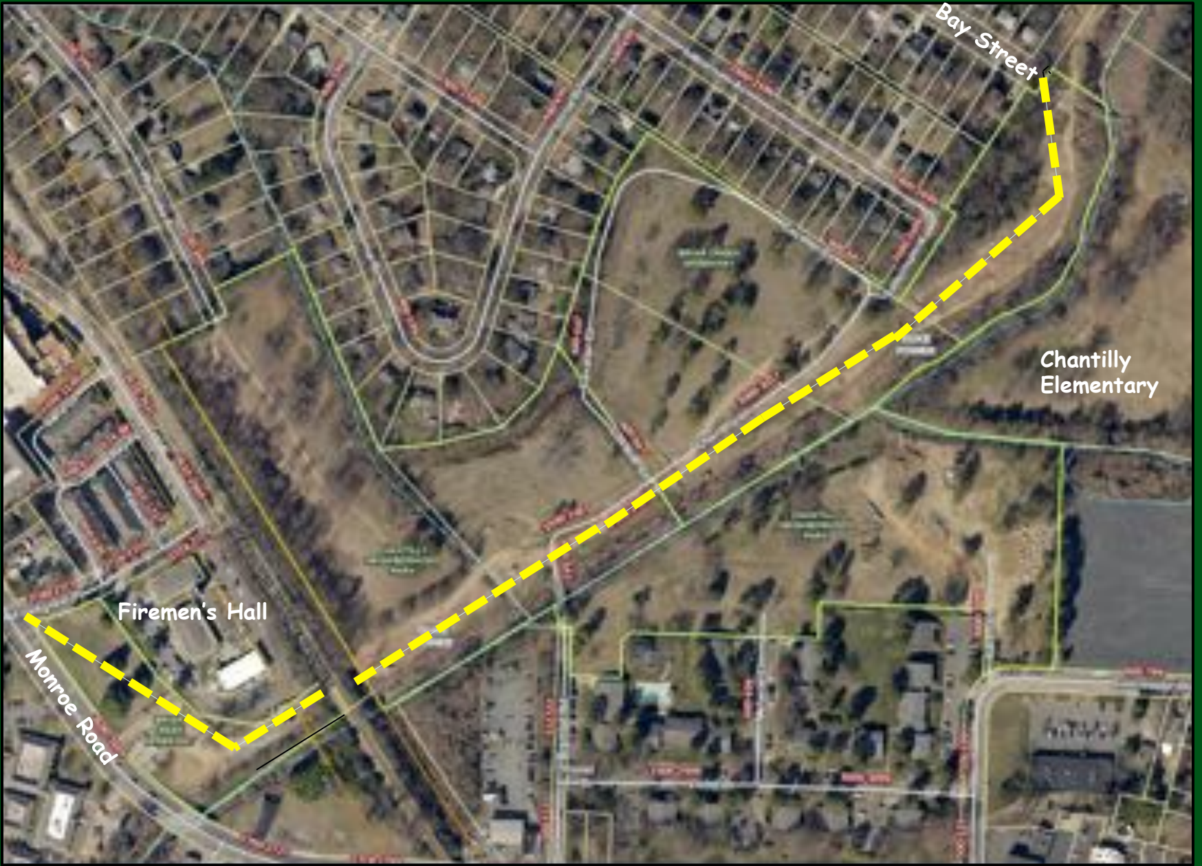
Bay Street to Monroe Road (FY19 Or later) $1,640,444