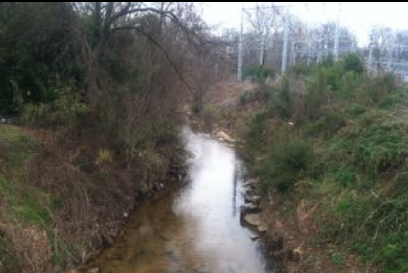
Looking north from Commonwealth Avenue