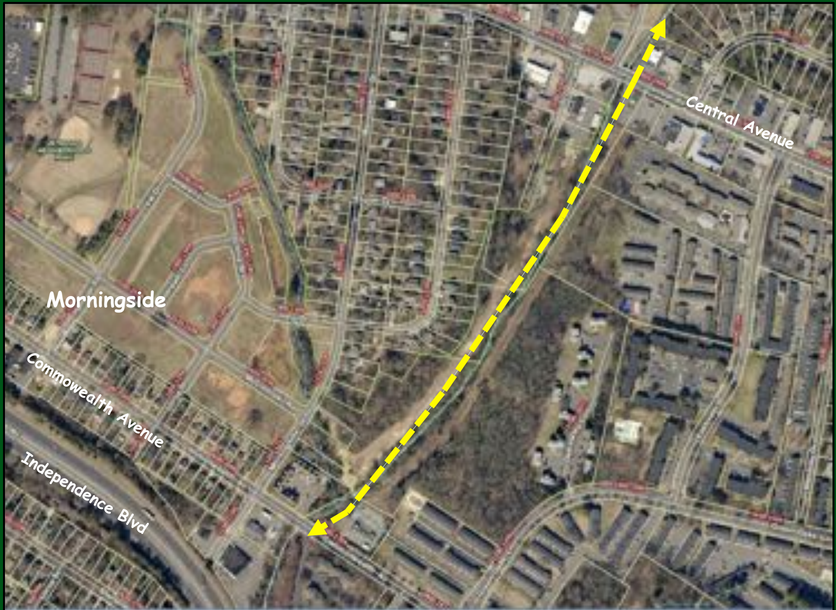
Central Avenue to Commonwealth Ave (FY16) $635,000